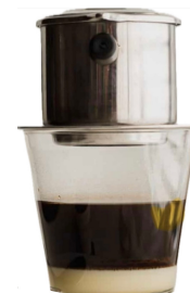
VIET MILK COFFEE